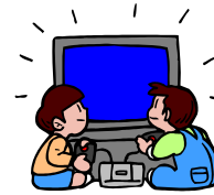
Play Video games