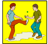
Playing with Friends