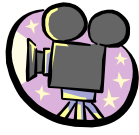
Watch a movie