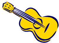
Play a Musical Instrument