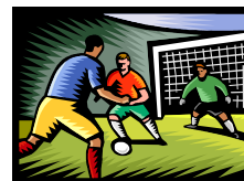
Playing on a team